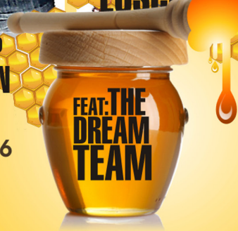
FEAT: THE DREAM TEAM

TICKETS AVAILABLE @ D RAY - 317-440-1275 TOTAL FASHION 317-347-0277 C AND R CATERING - (317) 507-0171 SOPHIA MARTIN PHOTOGRAPHY - (317) 250-2216 FOR MORE INFO CALL 317-507-0171 ONLINE @ TICKETWEB.COM