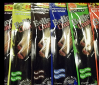
*MODEL CREDIT: TORI SKAGGS

DESIGN BY: WWW.BRIGHTWOODENTERTAINMENT.COM