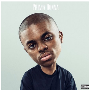
VINCE STAPLES PRIMA DONNA LONG BEACH, CA