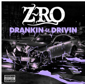
Z-RO DRANKIN' & DRIVIN' HOUSTON, TX