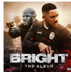
VARIOUS ARTISTS BRIGHT THE ALBUM EVERYWHERE, EARTH?