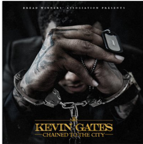
KEVIN GATES CHAINED TO THE CITY (EP) BATON ROUGE, LA