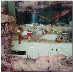
PUSHA-T DAYTONA VIRGINIA BEACH, VA