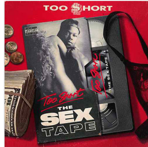
TOO SHORT THE SEX TAPE OAKLAND, CA