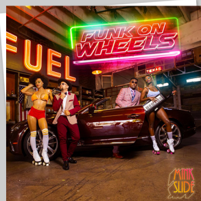
MINK SLIDE FUNK ON WHEELS LOS ANGELES, CA