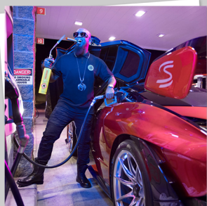
TECH N9NE ASIN9NE KANSAS CITY, MO